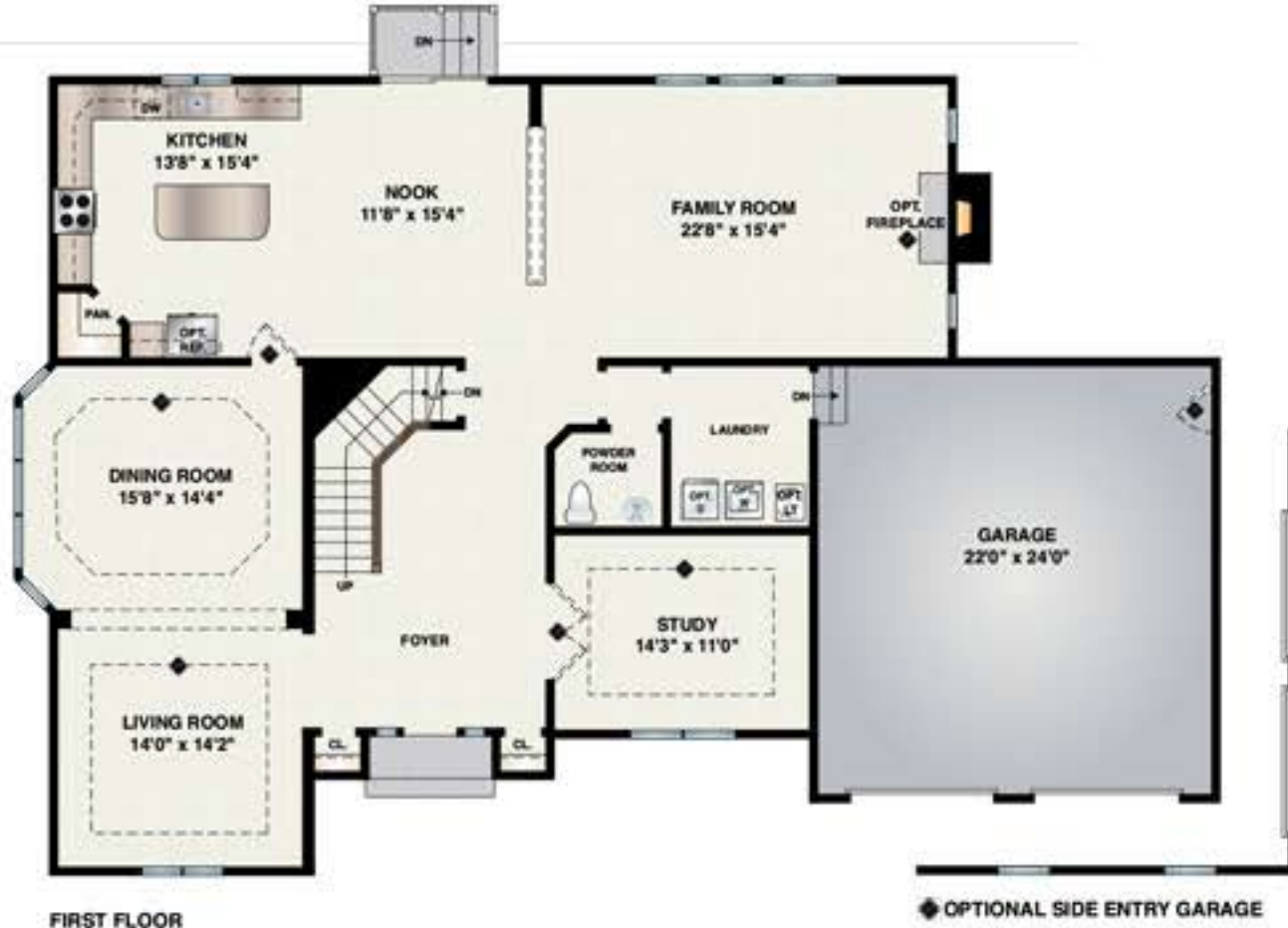
FIRST FLOOR ELEVATION I VINYL