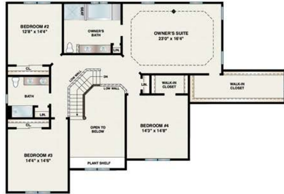
SECOND FLOOR ELEVATION I VINYL